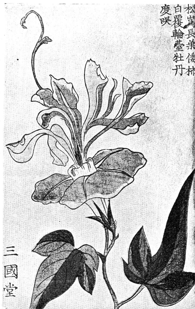
Fig. 2. The so-called Matsushima-variegated leaf pictured in Tohi-Syūkyō (1857).