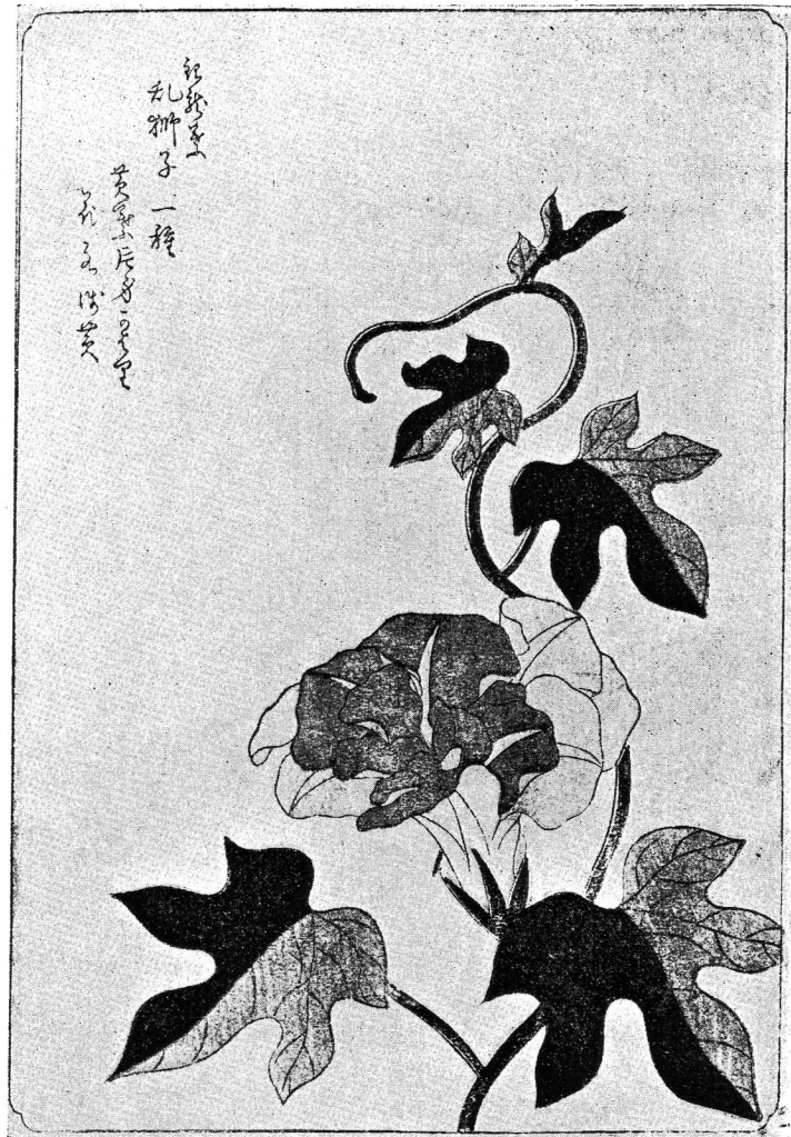
Fig. 1. The so-called Matsushima specimen pictured in Asagao-Sō (1817). This and most other pictures of Matsushima forms given in the old books are more or less exaggerated and not quite true to nature.