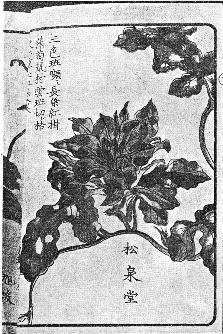
Fig. 5. A tricoloured leaf pictured in Tohi-Syûkyô (1857).